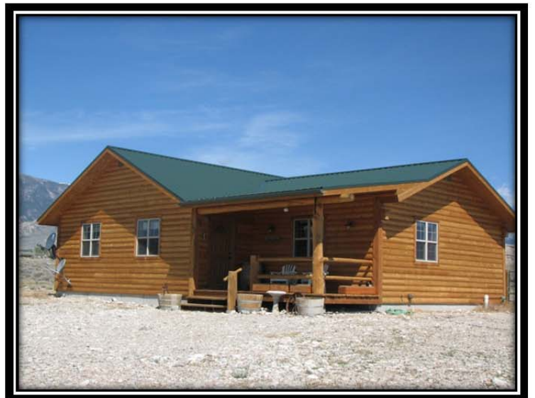
Rocky Mountain Dreaming