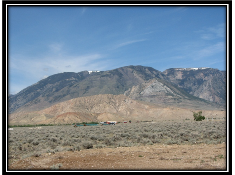
Clark Fork Canyon